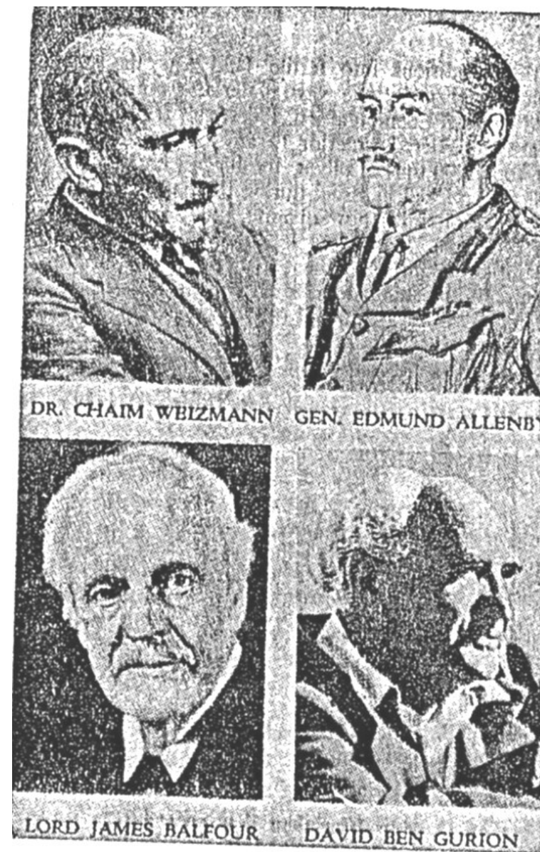
Sketching of Chaim Weizmann

The miraculous deliverance of Daniel from the lion’s den a very wonderful manifestation of the intervening hand of the Almighty