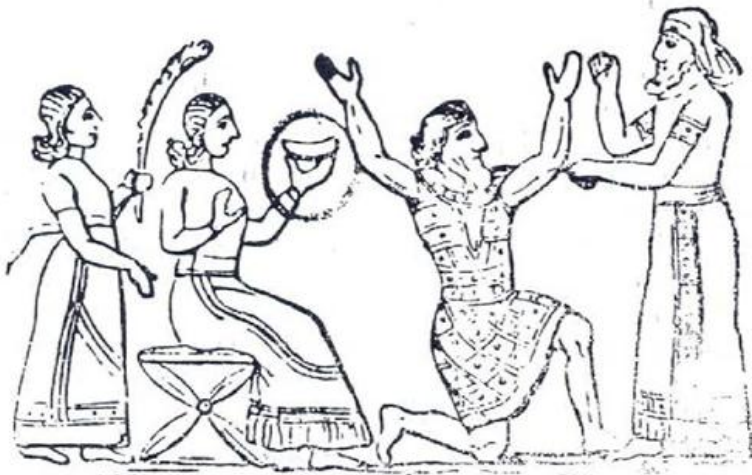
The woman with the cup from Babylon. From Kitto's Bible Encyclopedia.

Gospel shone so brightly, the Spirit of God bore this clear and distinct testimony by Paul: "The Mystery of iniquity doth already work" (2 Thess. 2:7). That system of iniquity which then began it was divinely foretold was to be destroyed "by the breath of the Lord's mouth, and consumed by the brightness of His coming" (v. 8). But at its first introduction into the Church, it came in secretly and by stealth, with "all deceivableness of unrighteousness." It wrought mysteriously under fair but false pretenses, leading men away from the simplicity of the truth as it is in Christ. And it did so secretly, for the very same reason that idolatry was secretly introduced in the ancient Mysteries of Babylon; it was not safe, it was not prudent to do otherwise. The zeal of the true Church, though destitute of civil power, would have aroused itself, to put the false system and all its abettors beyond the pale of Christianity, if it had appeared openly and all at once in all its grossness and this would have arrested its progress. Therefore it was brought in secretly, and by little and little, one corruption being introduced after another, as apostasy proceeded, and the backsliding Church became prepared to tolerate it, till it has reached the gigantic height we now see." "The Two Babylons".