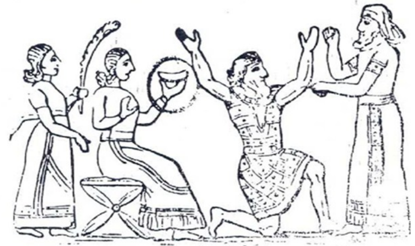
The woman with the cup from Babylon.

martyrs were sealing their testimony for the truth with their blood. Even then, when the Gospel shone so brightly, the Spirit of God bore this clear and distinct testimony by Paul: "The Mystery of iniquity doth already work" (2 Thess. 2:7). That system of iniquity which then began it was divinely foretold was to be destroyed "by the breath of the Lord's mouth, and consumed by the brightness of His coming" (v. 8). But at its first introduction into the Church, it came in secretly and by stealth, with "all deceivableness of unrighteousness." It wrought mysteriously under fair but false pretenses, leading men away from the simplicity of the truth as it is in Christ. And it did so secretly, for the very same reason that idolatry was secretly introduced in the ancient Mysteries of Babylon; it was not safe, it was not prudent to do otherwise. The zeal of the true Church, though destitute of civil power, would have aroused itself, to put the false system and all its abettors beyond the pale of Christianity, if it had appeared openly and all at once in all its grossness and this would have arrested its progress. Therefore it was brought in secretly, and by little and little, one corruption being introduced after another, as apostasy proceeded, and the backsliding Church became prepared to tolerate it, till it has reached the gigantic height we now see." "The Two Babylons".