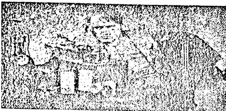
Thomas A. Edison with his first talking machine — 1888

So the book of Daniel is now to be read and studied. No man, or set of men, dare resist the words of Gabriel. He is in authority, a representative of heaven and higher than any on earth.