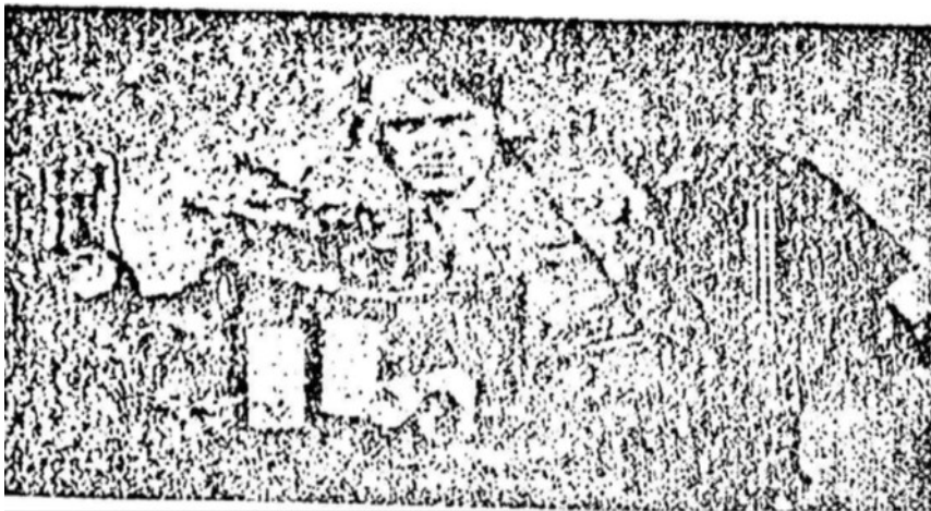
Thomas A. Edison with his first talking machine — 1888

So the book of Daniel is now to be read and studied. No man, or set of men, dare resist the words of Gabriel. He is in authority, a representative of heaven and higher than any on earth.