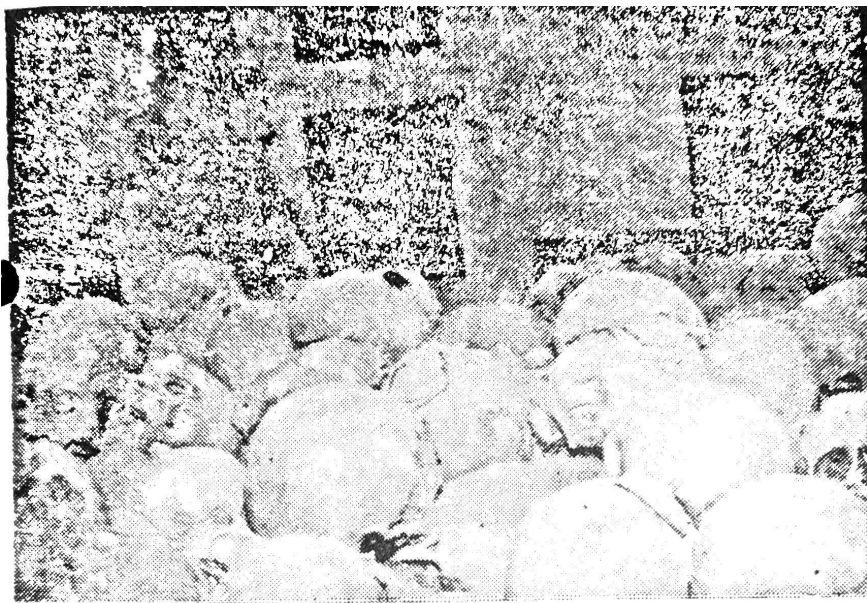
Skulls of three thousand in Mt. Sinai Cave.

This verse is quoted in 1 Cor. 10: 7, concerning these same idolatrous people who were slain in the wilderness at Sinai, and whose skulls remain as a living witness to the terrible consequence of disobedience. Also as an impressive lesson of the