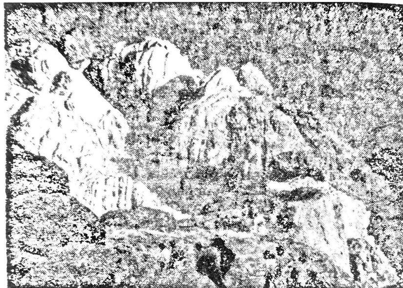
This shows Mount Sinai where the stream of water flows mentioned in connection with these great historical events.

These three thousand skulls found in a cave at Mount Sinai establish the truth of the Bible narrative concerning the giving and breaking this law by Moses and Israel at Sinai.