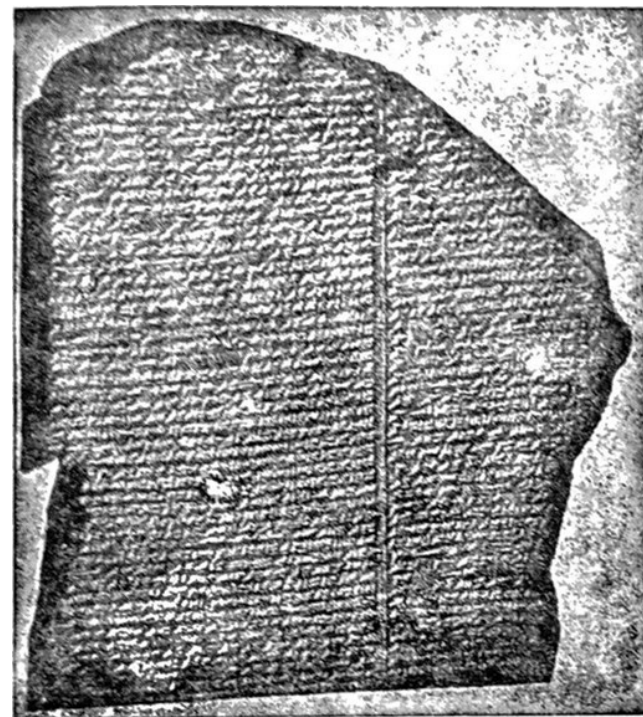
The Rosetta stone

"AND IN THE DAYS OF THESE KINGS shall the God of heaven set up a kingdom which never will be destroyed, and the kingdom shall not be left to other people but it shall break in pieces and consume all of these kingdoms and it shall stand forever. For-as-much as thou sawest the stone cut out of the mountain WITHOUT hands, and it break in pieces the iron, the clay, the brass, the silver and the gold. The great GOD HATH MADE KNOWN to the king what shall take place hereafter. The dream is CERTAIN, and the interpretation thereof is SURE." Verse 45.